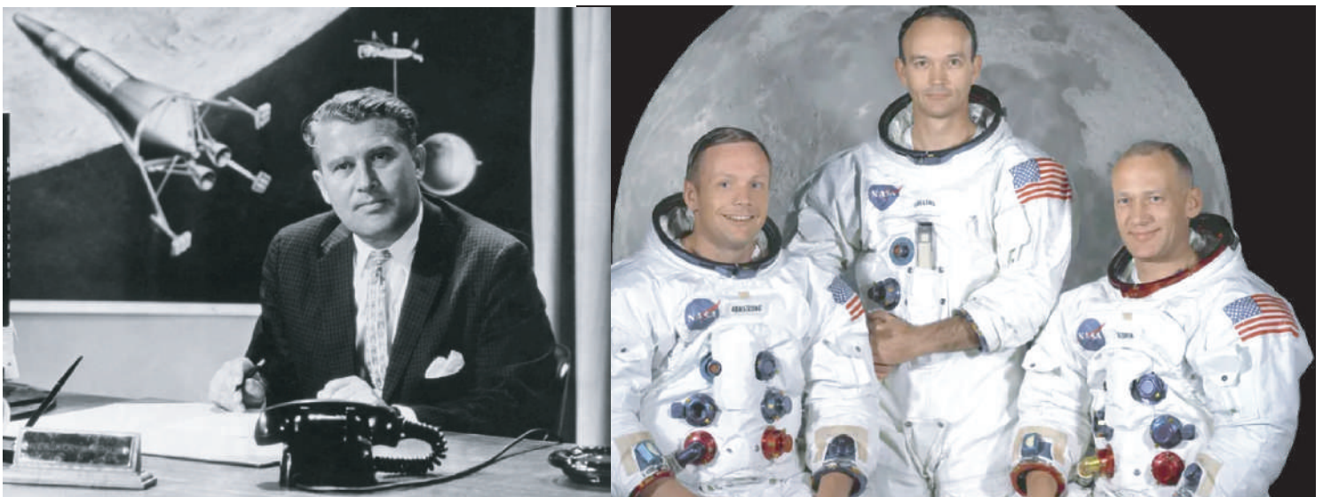
Von Braun in his office at Marshall Space Flight Center | Purdue, Neil, Armstrong: Apollo Lunar 11 landing 20 July 1969

The 8 Ivy League Universities including Harvard, Princeton and Yale are also the endowment Schools of Businesses in the United States, how also the American Assembly of Collegiate Schools of Business in 1916 to provide accreditation to schools of business for hundred a years ago in 1916. The five institutions with the largest Ivy's endowments FY2021 were Harvard $53 billion, Yale $42 billion, Stanford $38 billion, Princeton University, $37 billion, University Texas System $40 billion and the United States in all institution $700 billion.