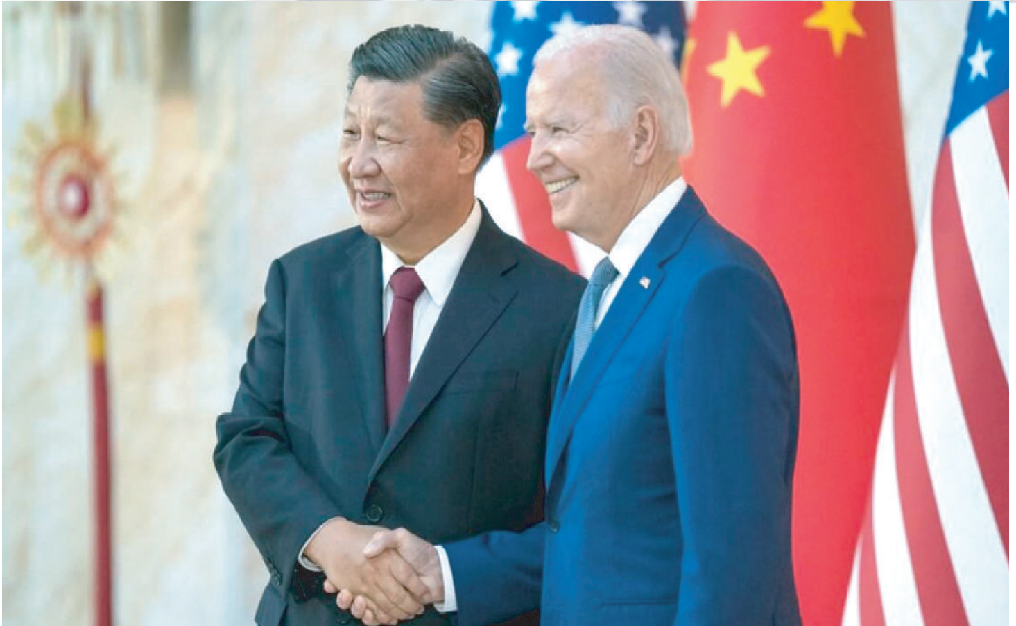
President President Xi Jinping with Joseph R. Biden, Jr., on 14th November 2022 in Bali, Indonesia

On the afternoon of 14 November local time, President Xi Jinping had a meeting with U.S. President Joe Biden in Bali, Indonesia. The two presidents had a candid and in-depth exchange of views on issues of strategic importance in China - U.S. relations and on major global and regional issues. First, jointly developing a right perception. China is consistently committed to having a stable, healthy and sustainable relationship with the United States.