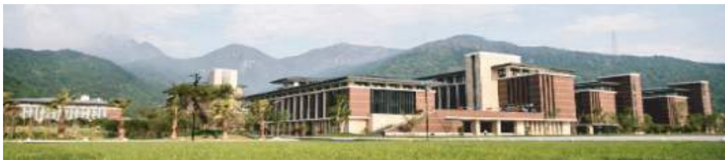
Kean University-Wenzhou at Zhejiang, province in eastern China population 57 million (2018).

For students who wish to learn in a new culture, Kean operates an international campus in China which hosts students for a semester abroad program. In 2006, the university announced that it was seeking approval from the Chinese and U.S. educational governing bodies to be the first American university to open an extensive University campus on Chinese soil. The new campus is located in Wenzhou, Zhejiang Province, one of the richest, fastest growing Chinese provinces. The Chinese campus has a growing student body.